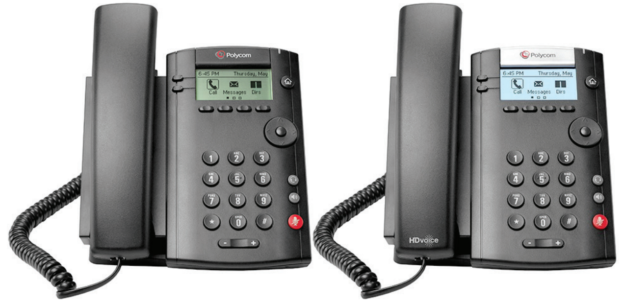
Polycom VVX 101 and Polycom VVX 201